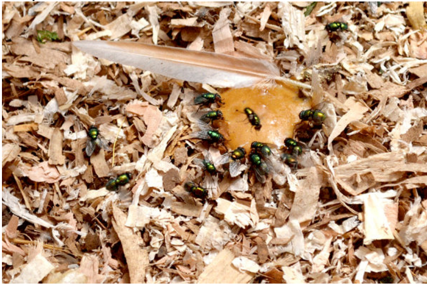
Flies like to eat manure, which is animal poop, or old garbage. Some of the germs from these